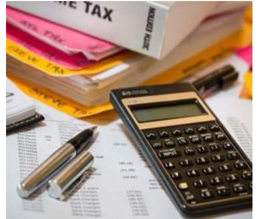
Types of Compliances for MSMEs

In addition, they are subject to approximately 364 Compliances in a year. The table below provides a summary.